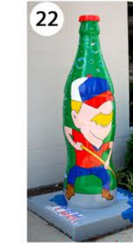
22 TBM Building Services 20 N 14th St Artist: Troy Fears