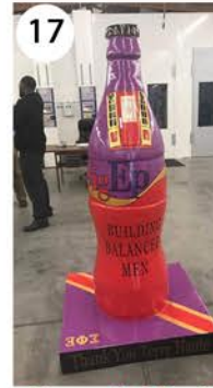
17 Sigma Phi Epsilon 831 N 5th St Artist: Troy Fears