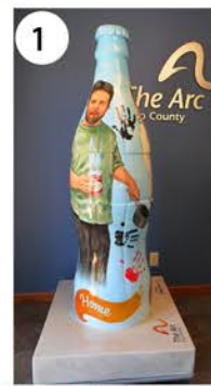
1 Arc of Vigo County 11 Cherry St Artist: James Shepard