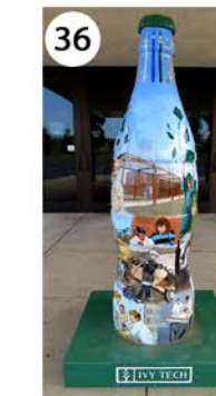
36 Ivy Tech 8000 Education Dr