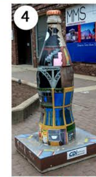
4 CDI, Inc 600 Wabash Ave Artist: Jackie Tice