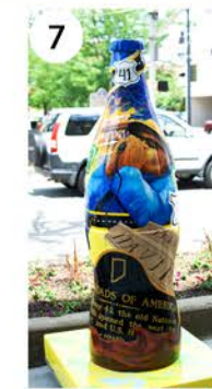
7 Corner Grind 683 Wabash Ave Artist: Becky Hochhalter