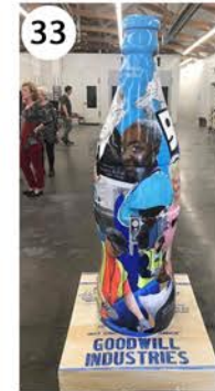
33 Goodwill Industries 2702 S 3rd St Artist: Becky Hochhalter