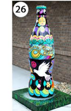
26 Sycamore Storage 3250 Locust St Artist: Cathleen Hogan