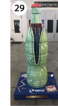
29 Tabco 1100 State Road 46 Artist: Chelsea Moody