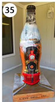
35 CAVU Ops 2500 Prairieton Rd Artist: Becky Hochhalter